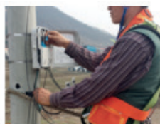
Work Belt on the telephone pole