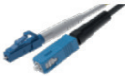
Fusion Splice-On Connector

77,000 fibers + 33,000 fibers (Adjust the blade height up to 0.12mm), Total 110,000 fibers